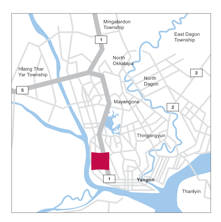
Description of Location